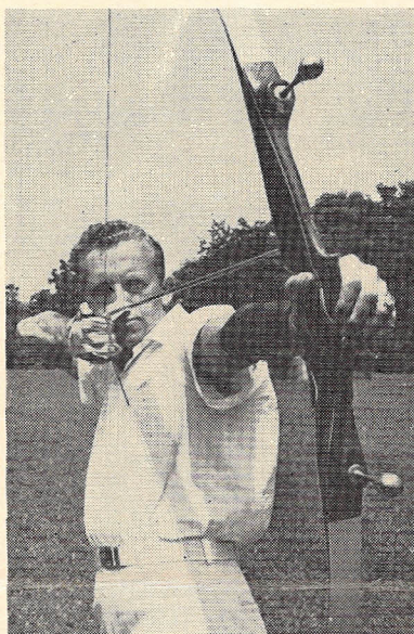
Wyatt Mays Photo

The next Board of Directors meeting of the VBA (Sept. 26) will be the scheduling session for invitational shoots for the upcoming year. It is asked that clubs in each particular zone "get-together" and come-up with a non-conflicting schedule.