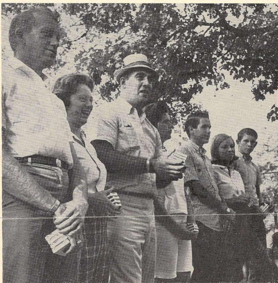
VIRGINIA STATE CHAMPIONS