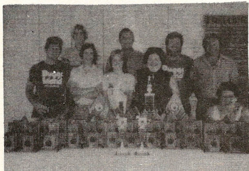
Members of Bugs Island Archers

A special thanks goes to all the people who helped to make the shoot possible and to all of you who made it so enjoyable by participating and just being friends.