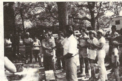
Awarding trophies at PAB Silver Quiver

In September, PAB will be hosting the BROADHEAD JAM-BOREE-EAST, with our 3D animals. As usual, the life-like animals will be shot from the tree stands at unmarked distances. The running deer target will also be used. Broadheads are the order of the day, so come on down and limber up those hunting skills. Chiggers and mosquitoes have been special ordered to make this as realistic as possible.