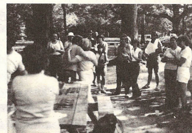
all photos courtesy of Norman Hughey