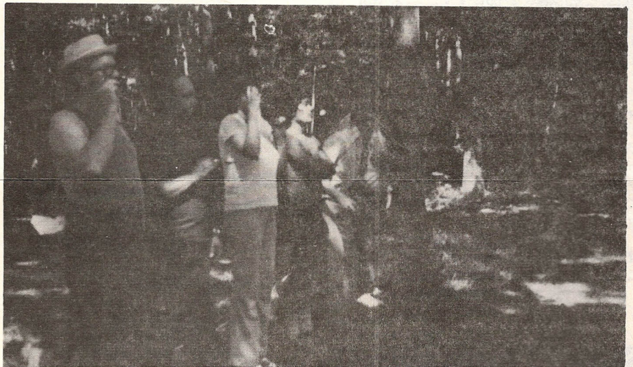
Cotton ball race at the picnic