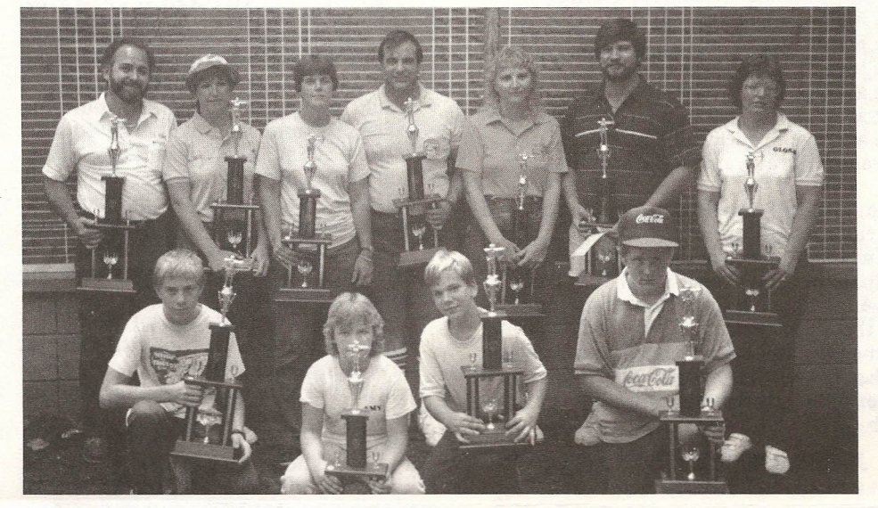
A few of our 1987 State Closed Champions.

Warwick Bowmen would like to thank the 175 shooters that braved the rain to attend the 1987 State Closed Tournament. In spite of the weather some excellent scores were shot. Warwick would like to invite everyone back for the Mid-Atlantics in June of '88 and the State Closed in September of '88. Hopefully, the weather will cooperate and the range will be a little drier.