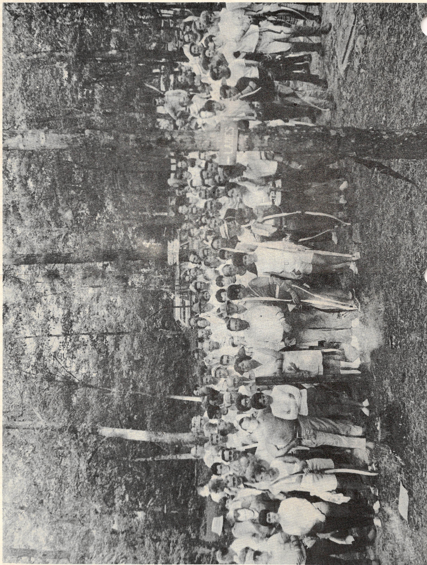
ALL STATE SHOOT