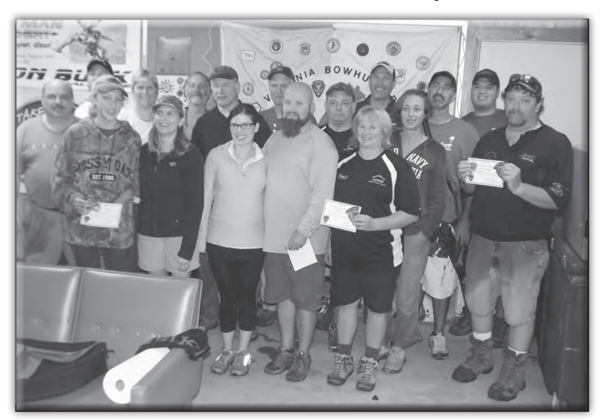
2013 Fall 3-D Classic Winners