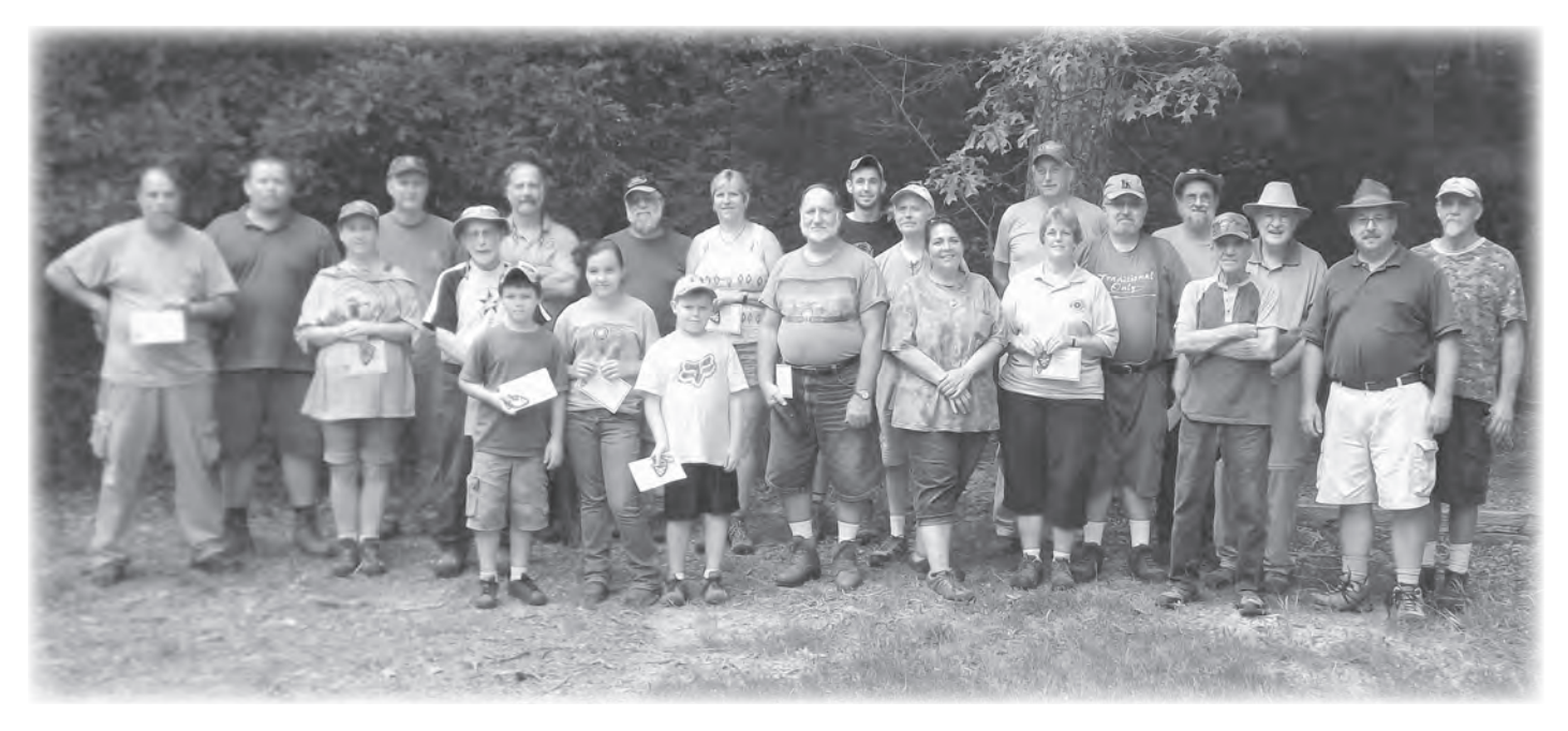
2013 State Closed Overall Winners