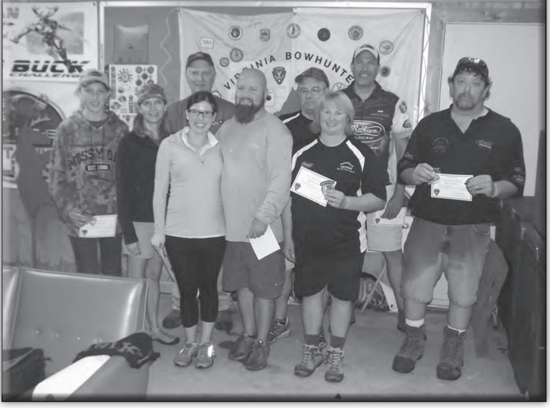
2013 Fall 3-D Classic State Champions