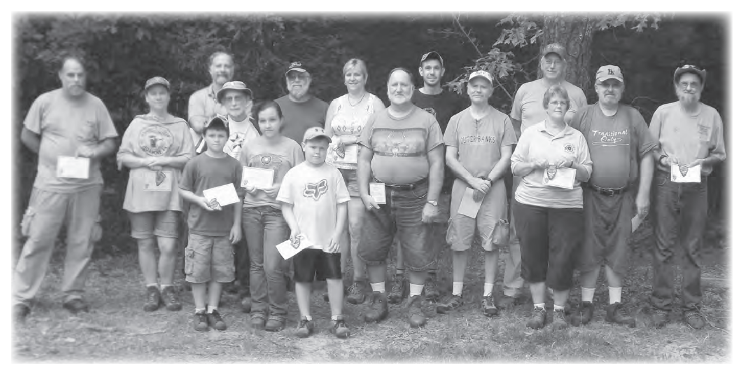
2013 State Closed Champions