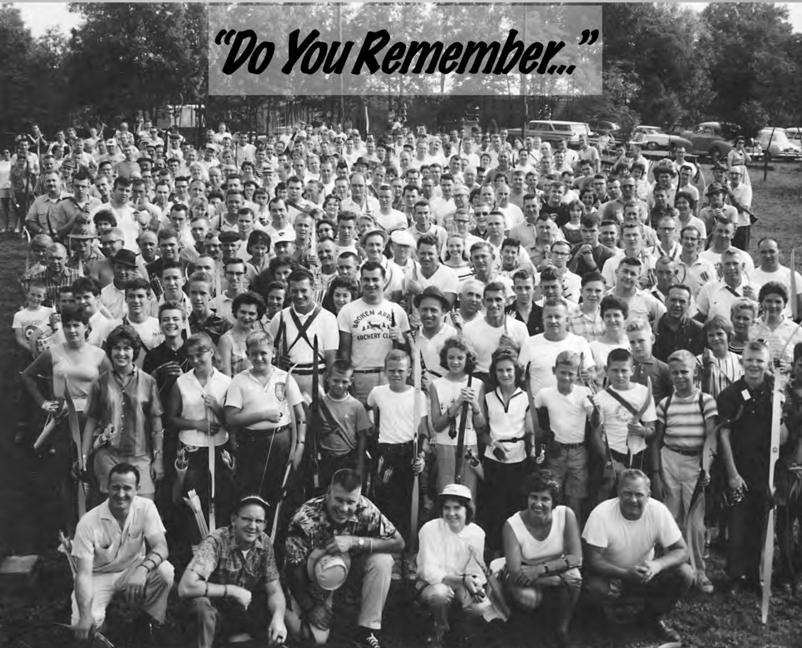
Augusta Archers hosting the State Closed Championship in the mid 1960's.