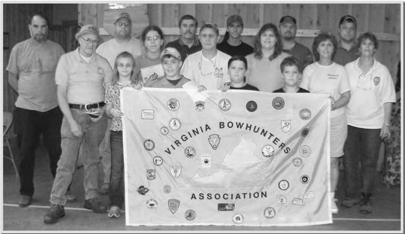
2006 VBA State Closed Champions