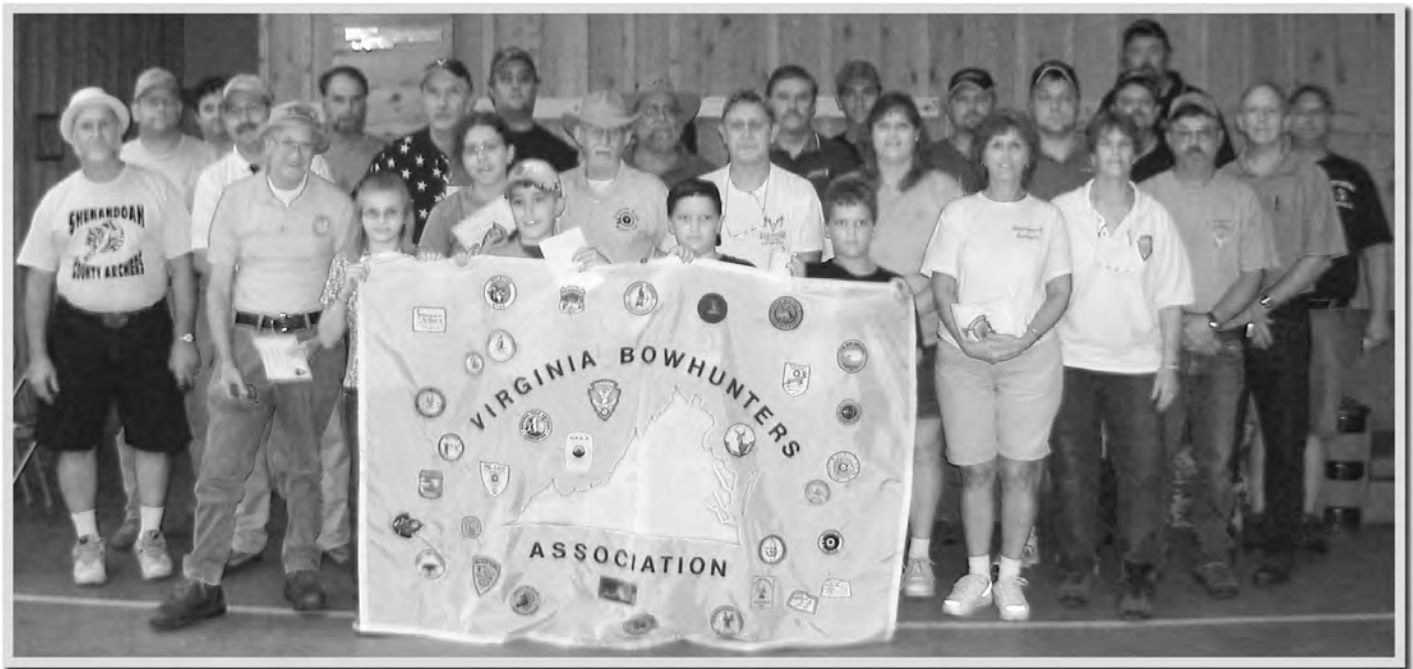
2006 VBA State Closed Overall Winners