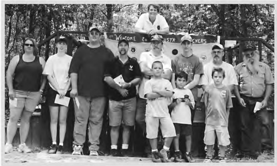
VBA State Champions 2006 Fall 3D Classic