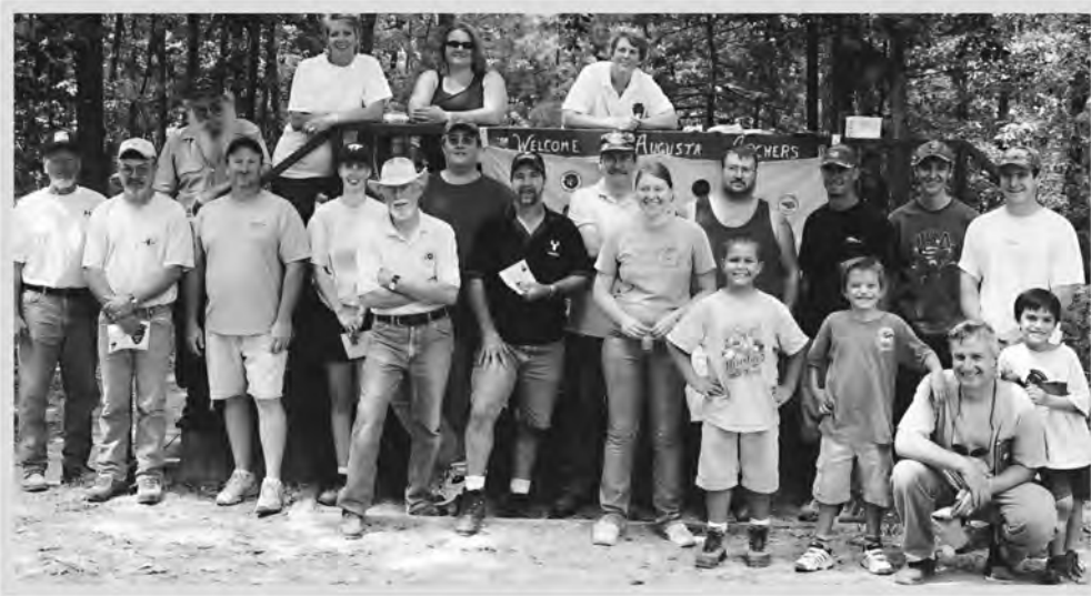
Overall Winners at the 2006 Fall 3D Classic