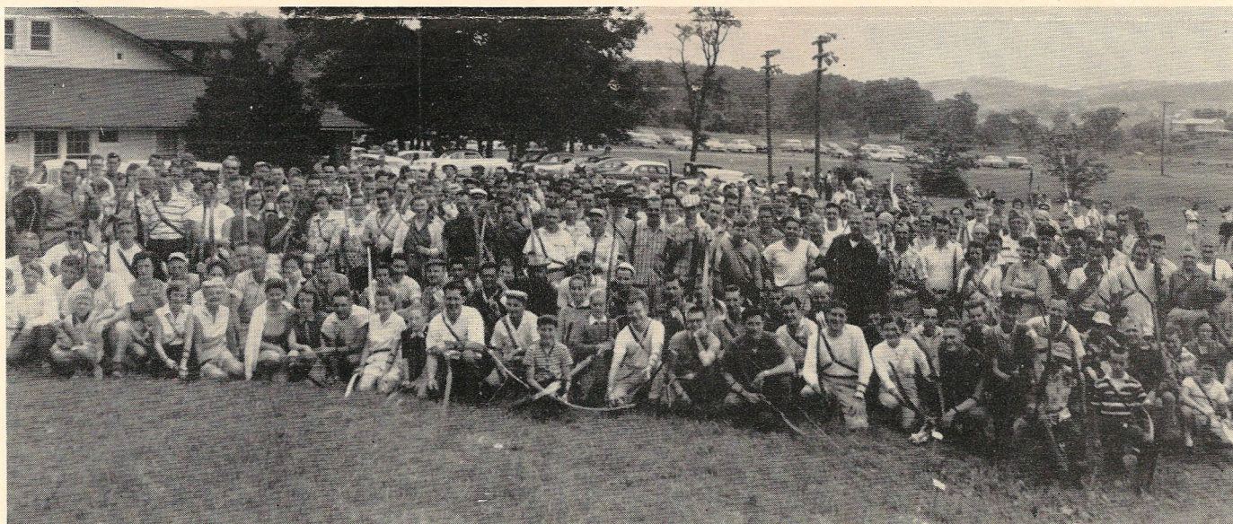
The above picture shows the participants of the Virginia Bowhunters Associations State Championship Tournament.