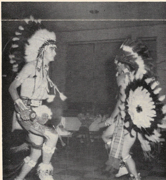
Shakeum, Rattleum, and Rollum! The Tsungani Indian Dancers, members of the Boy Scout Troop 84 of Stuarts Draft, Va., perform a real Indian dance. These dancers will be a feature of the State Championship Tournament at 8:30 P.M. Saturday, Sept. 6. Bringum squaw and papooses for real "Injun" treat.