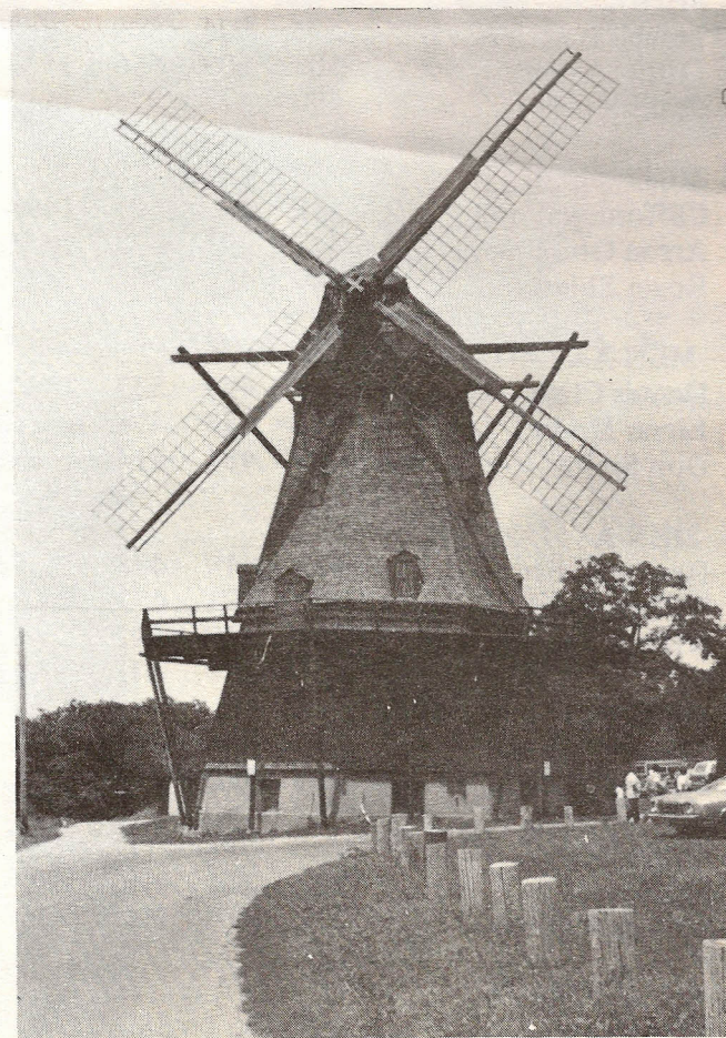
The famous windmill at Aurora Ill. - Site of '78 Nationals.