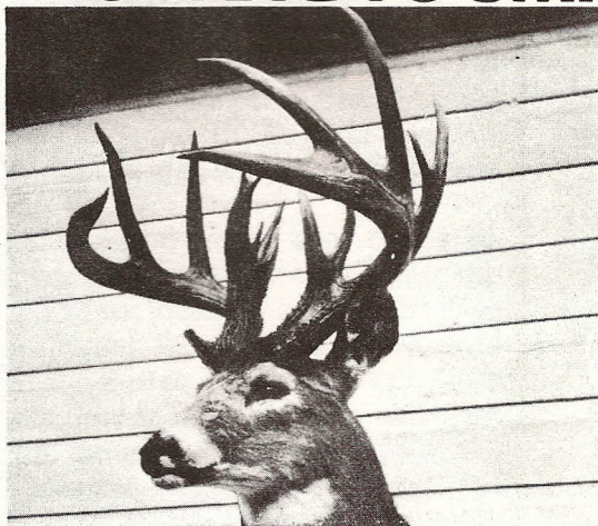
—October 25, 1976, Montana. The Biggest Whitetail Buck Taken in North America in 1976. Brought down with a 70 lb. Bow and Black Diamond Delta 4-Blade Broadhead and 2219 Arrow at 12 yards coming into Tink's #69 DOE-IN-RUT BUCK LURE. Both antlers measured 7 1/4" around the base!