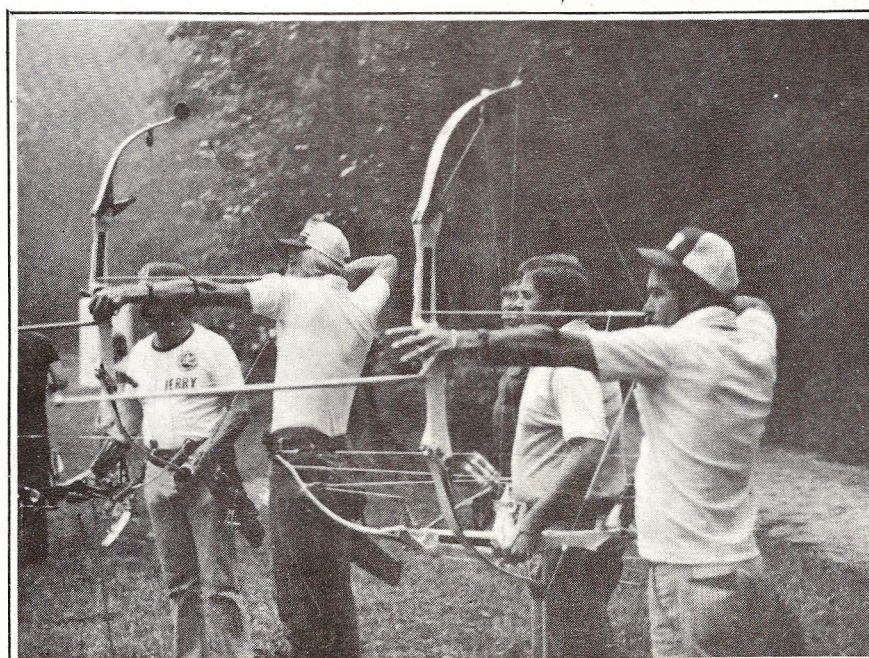
Showing a little Barebow Form