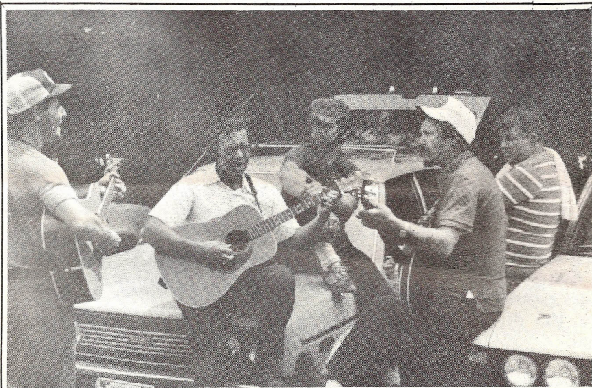
This "after-the-shoot" entertainment was super.