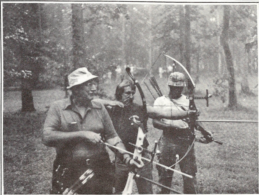
Tex always shows up at our state shoot - Did You?