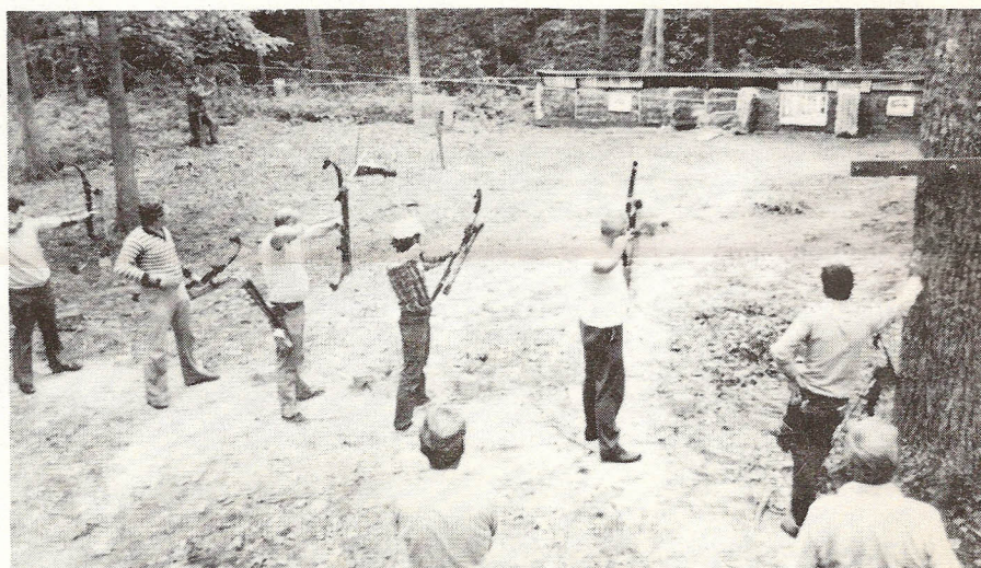
An archer shooting at a deer target at unmarked distances at the Bowhunter Jamboree-West at Sherwood Archers in Roanoke.