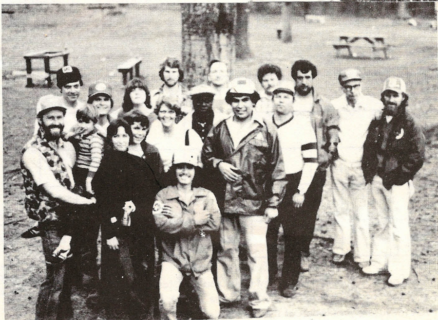
Some of the Princess Anne Indoor League members.