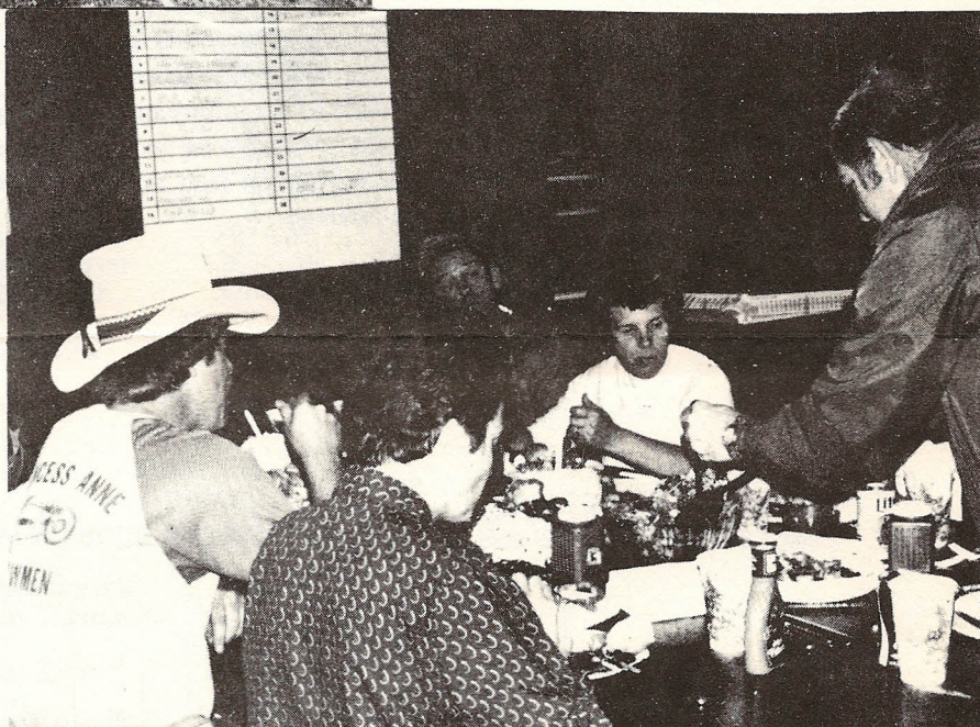
Indoor League Dinner.