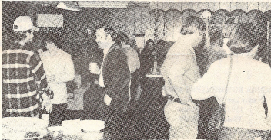
INDOOR LEAGUE BANQUET