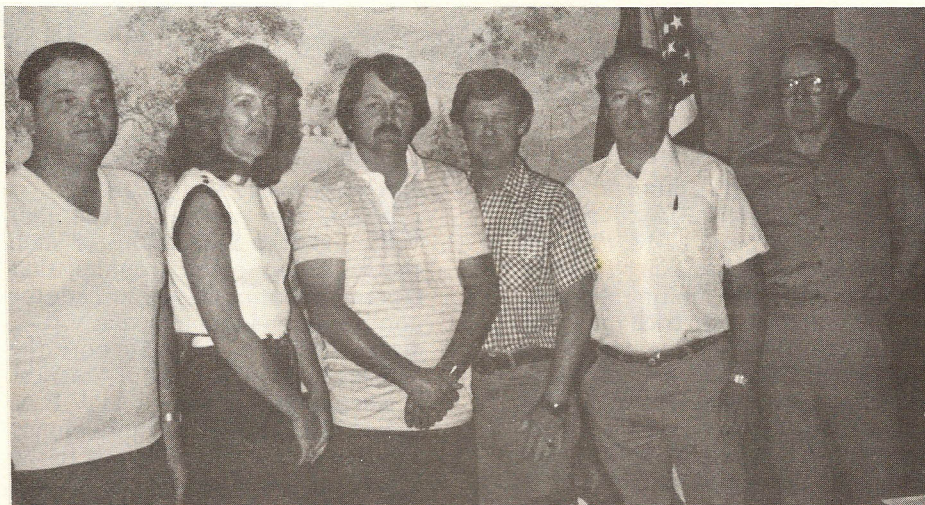
New VBA officers installed at June '83 VBA meeting.

Cub Run Archer's motion passed 3/27/83).