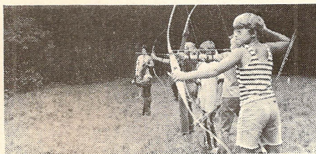
I think the running deer escaped this time, but just wait a few years.

Groups representing the National Forests, State Forests, and Game and Inland Fisheries had booths at the Jamboree.