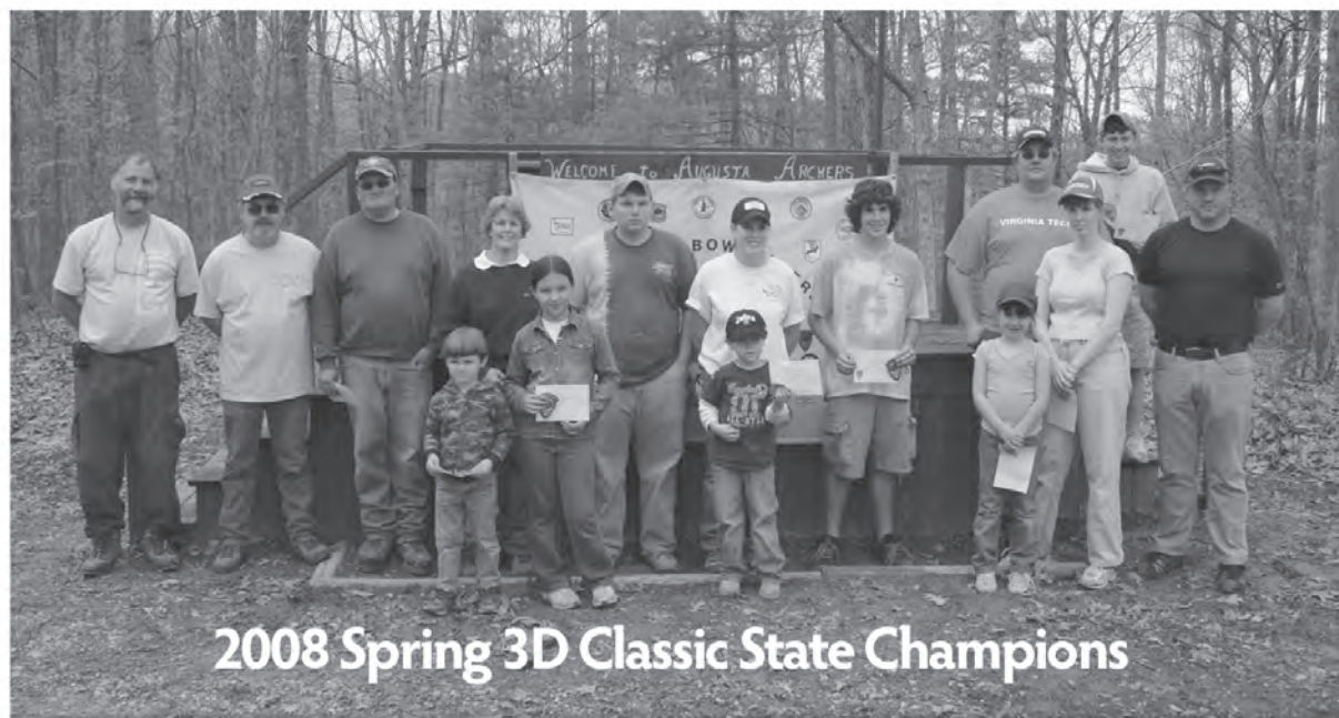
2008 Spring 3D Classic State Champions

THE OFFICIAL PUBLICATION OF THE VIRGINIA BOWHUNTERS ASSOCIATION