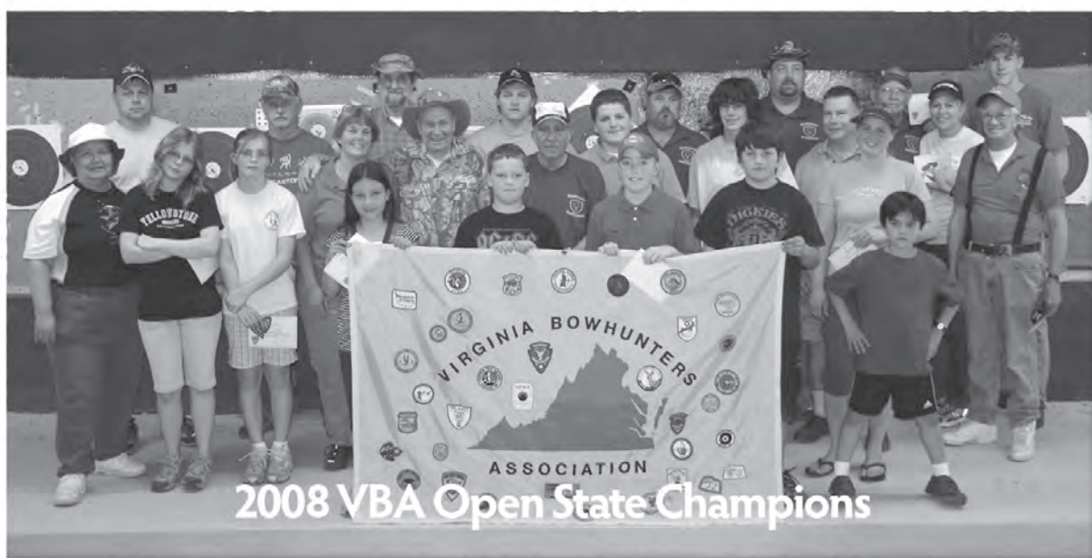
2008 VBA Open State Champions