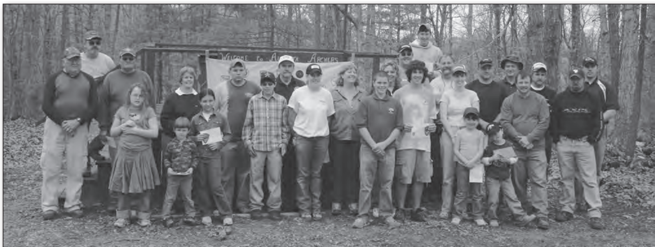
The 3D Spring Classic Overall Winners